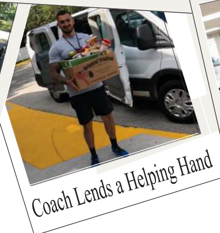
Coach Lends a Helping Hand