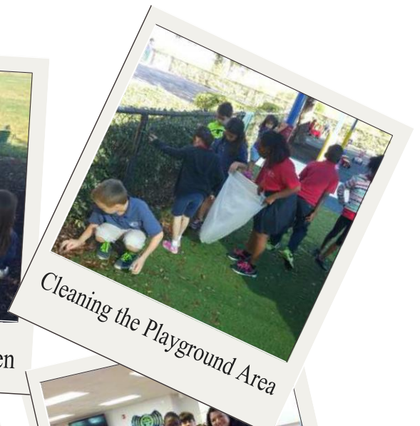
Cleaning the Playground Area