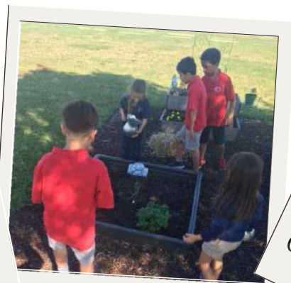
Maintaining PCA's Garden