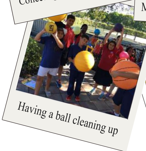
Having a ball cleaning up