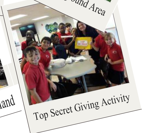
Top Secret Giving Activity