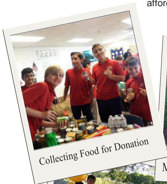
Collecting Food for Donation

We are thankful for service-minded students and staff at our Academy. For Thanksgiving, PCA students did a lot of giving to those in need and to the school. They participated in a food drive, aided in relief for Puerto Rico and cleaned and organized the school to show their gratitude for the many blessings they have been afforded! A round of applause for our dynamic students and staff!